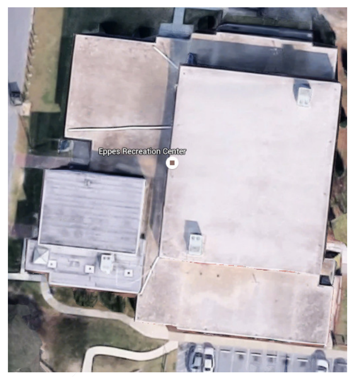
Overview of Roof