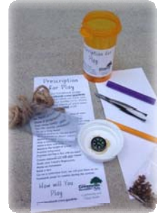
Prescription for Play →