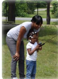
National Kids to Park Play Day ←