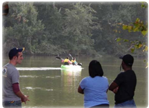
Kayak/Canoe/Paddle Boat Demo Night at River Park North