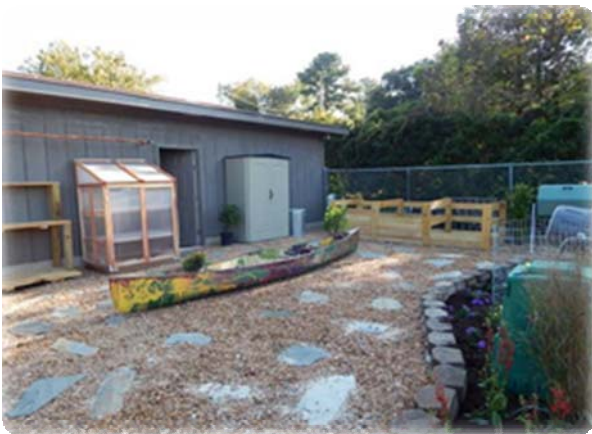
Compost and Garden Site at River Park North