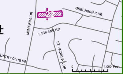
Inset of Oakmont House & Gardens (22)