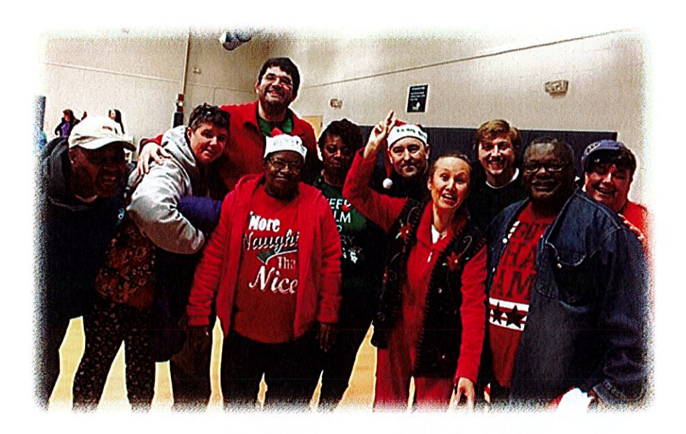
Specialized Recreation Holiday Dance held at the Drew Steele Center