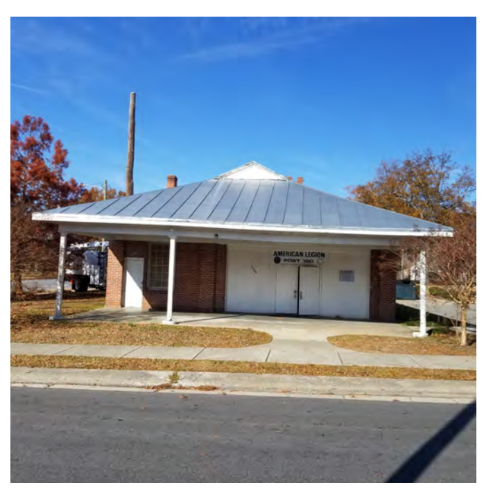
PHOTOGRAPH NO. 24: EXTERIOR FRONT VIEW