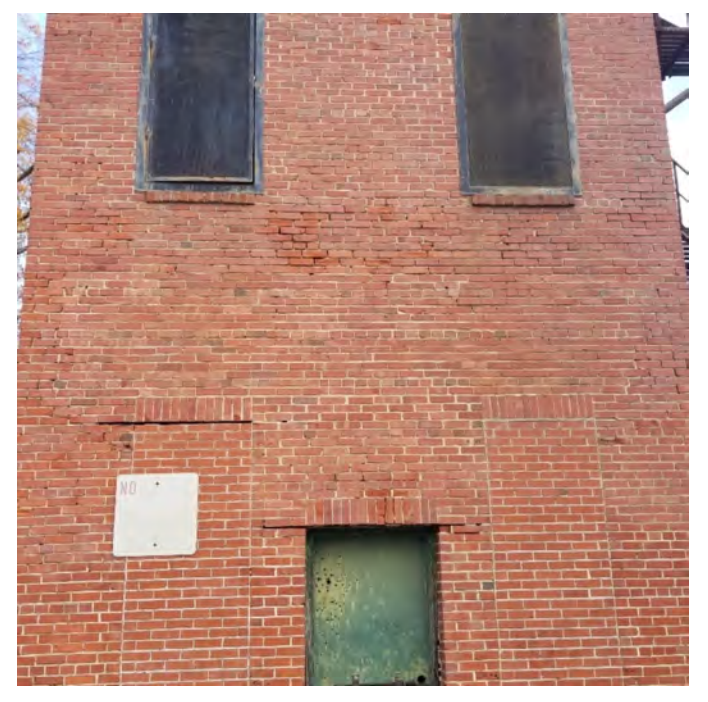
PHOTOGRAPH NO. 12: SIDE VIEW 1ST FLOOR