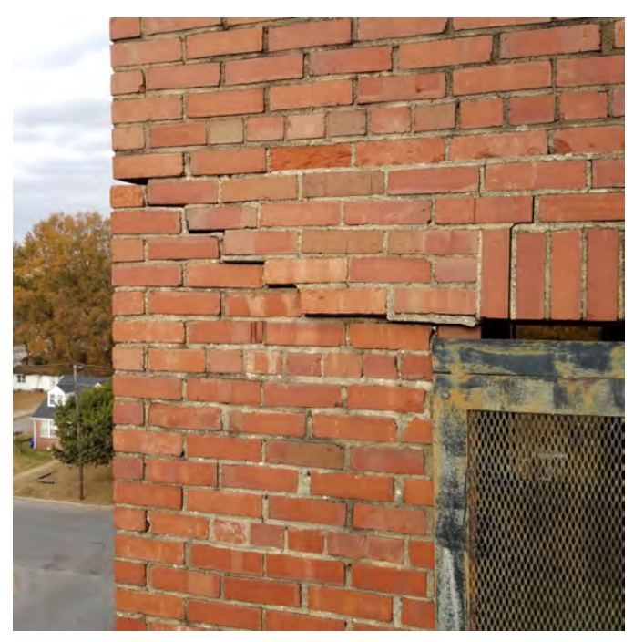
PHOTOGRAPH NO. 17: BROICK SHIFTED/UNSTABLE