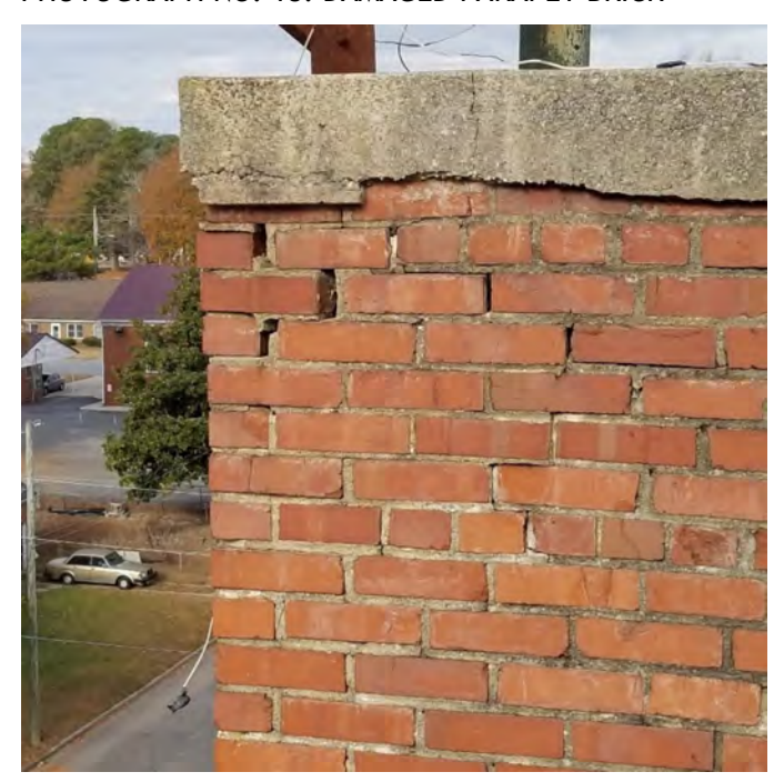
PHOTOGRAPH NO. 19: LOOSE BRICK AT PARAPET