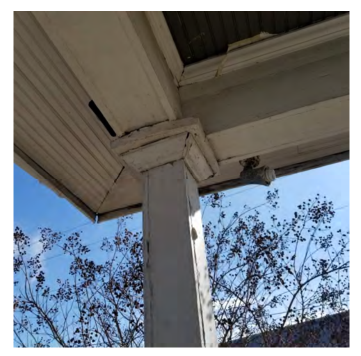
PHOTOGRAPH NO. 37: DETERIORATED ENTRY COLUMN AT TOP