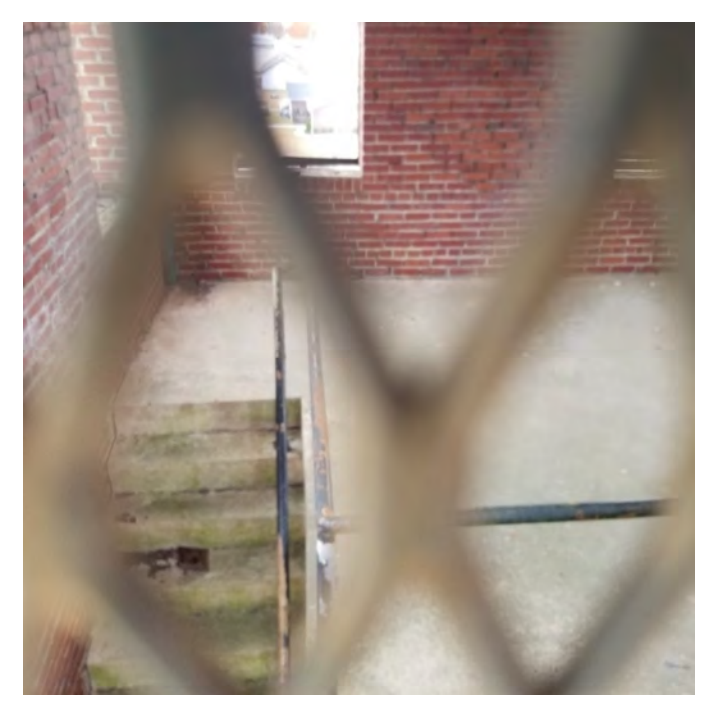
PHOTOGRAPH NO. 22: INTERIOR VIEW OF STAIRS/LANDING