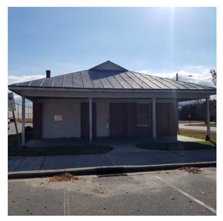
PHOTOGRAPH NO. 25: EXTERIOR REAR VIEW