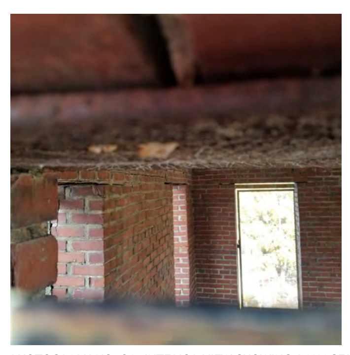
PHOTOGRAPH NO. 21: INTERIOR VIEW SHOWING DAMAGED BRICK