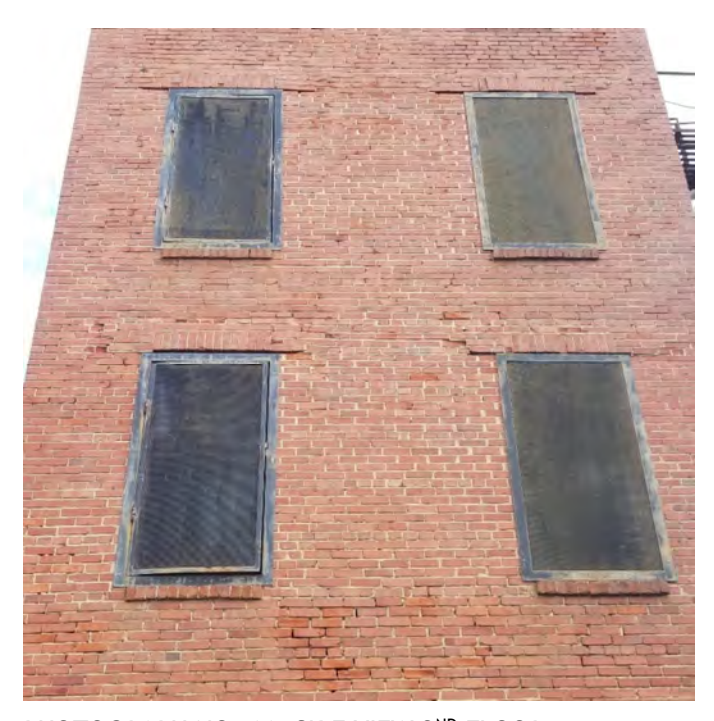
PHOTOGRAPH NO. 11: SIDE VIEW 2<sup>ND</sup> FLOOR