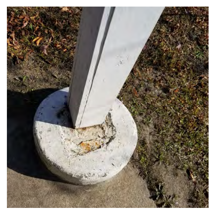
PHOTOGRAPH NO. 35: REPLACED ENTRY COLUMN