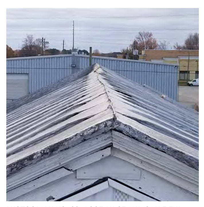
PHOTOGRAPH NO. 28: ROOF RIDGE AND GABLE END