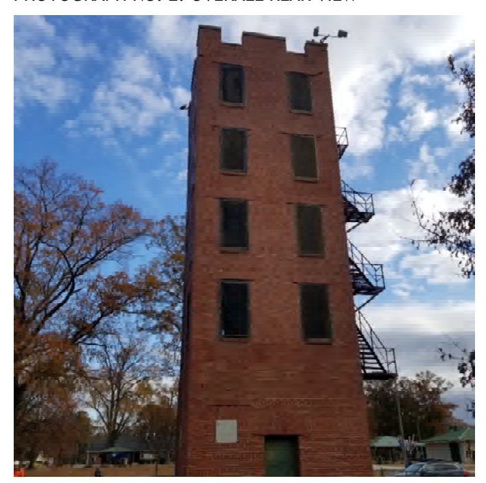
PHOTOGRAPH NO. 3: OVERALL SIDE VIEW