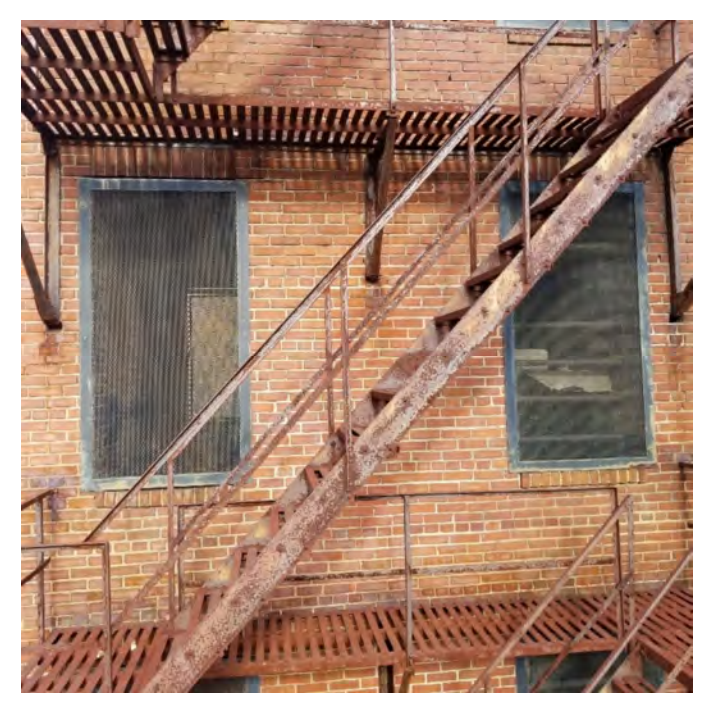
PHOTOGRAPH NO. 6: FRONT VIEW 3RD FLOOR