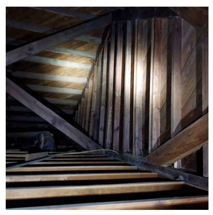
PHOTOGRAPH NO. 33: WALL FRAMING AT ROOF GABLE END