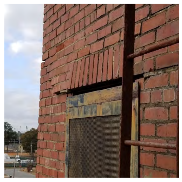
PHOTOGRAPH NO. 16: BRICK SHIFTED/UNSTABLE