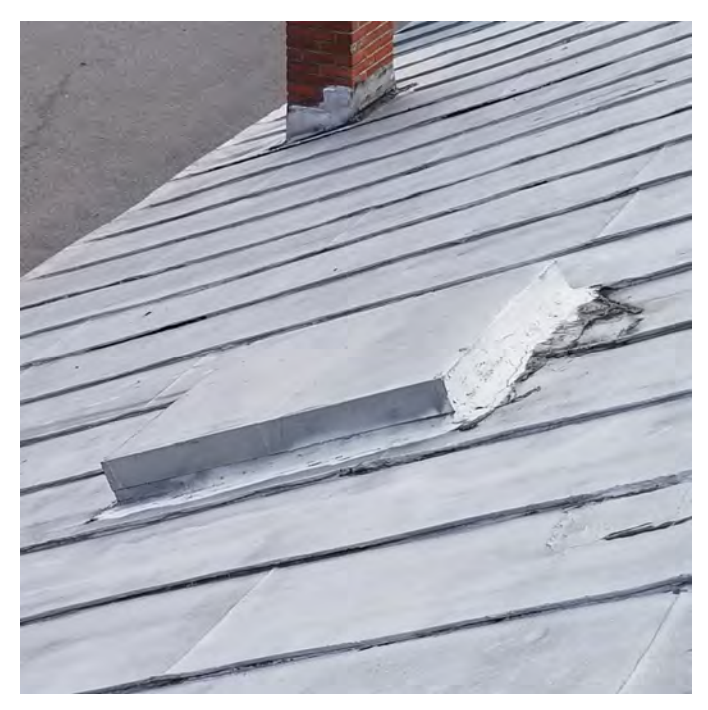
PHOTOGRAPH NO. 29: COVERED SKYLIGHT