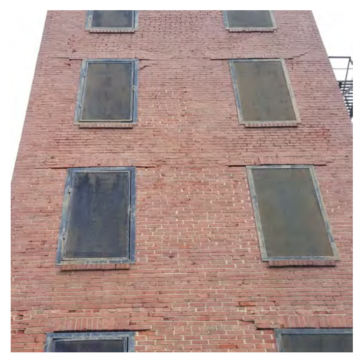
PHOTOGRAPH NO. 10: SIDE VIEW 3RD FLOOR