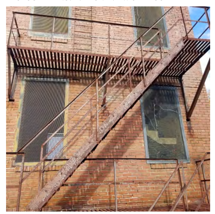
PHOTOGRAPH NO. 5: FRONT VIEW 4<sup>TH</sup> FLOOR