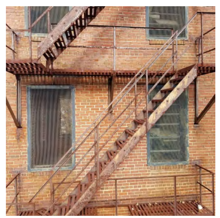
PHOTOGRAPH NO. 7: FRONT VIEW 2<sup>ND</sup> FLOOR