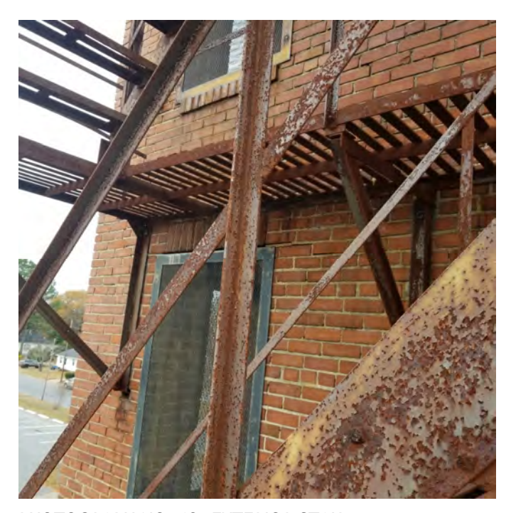
PHOTOGRAPH NO. 13: EXTERIOR STAIR