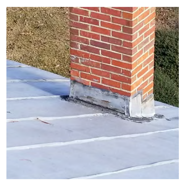
PHOTOGRAPH NO.32: FLASHING AT CHIMNEY