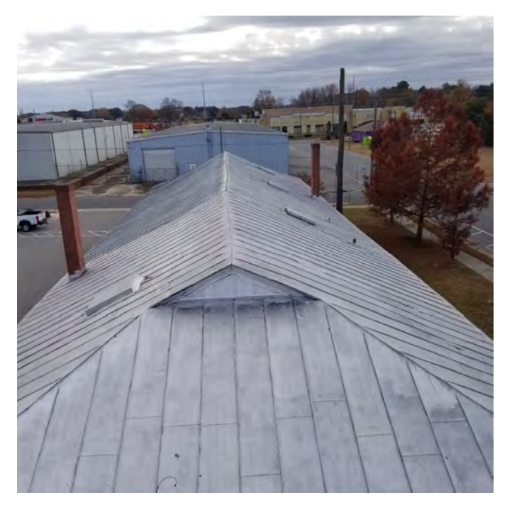
PHOTOGRAPH NO. 27: OVERALL VIEW OF ROOF