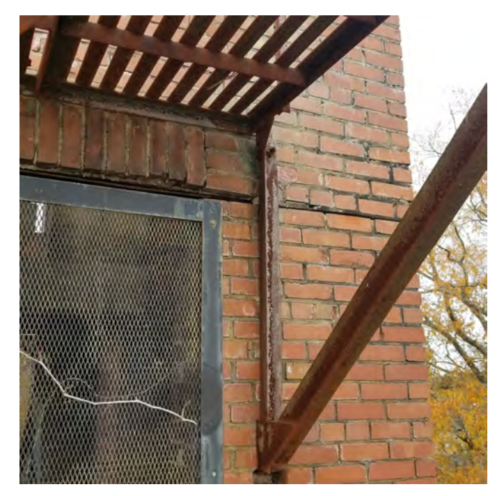
PHOTOGRAPH NO. 14: LINTEL CORROSION