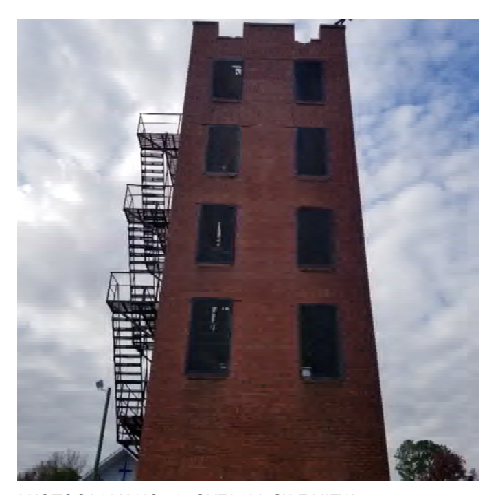
PHOTOGRAPH NO. 1: OVERALL SIDE VIEW