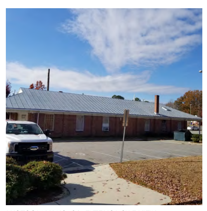
PHOTOGRAPH NO. 26: EXTERIOR SIDE VIEW