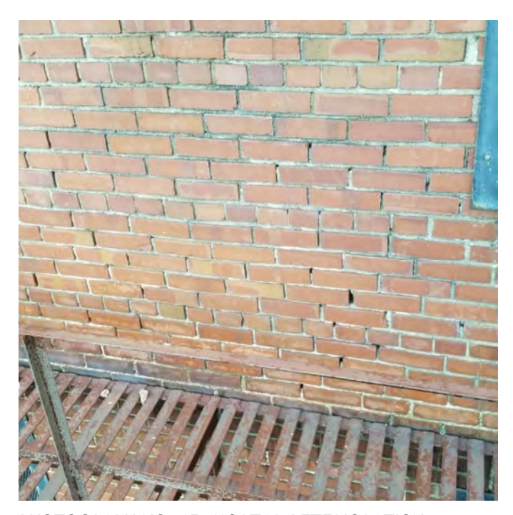
PHOTOGRAPH NO. 15: MORTAR DETERIORATION