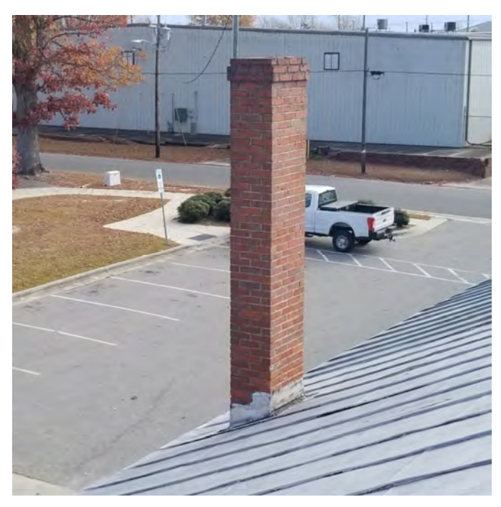
PHOTOGRAPH NO. 31: CHIMNEY