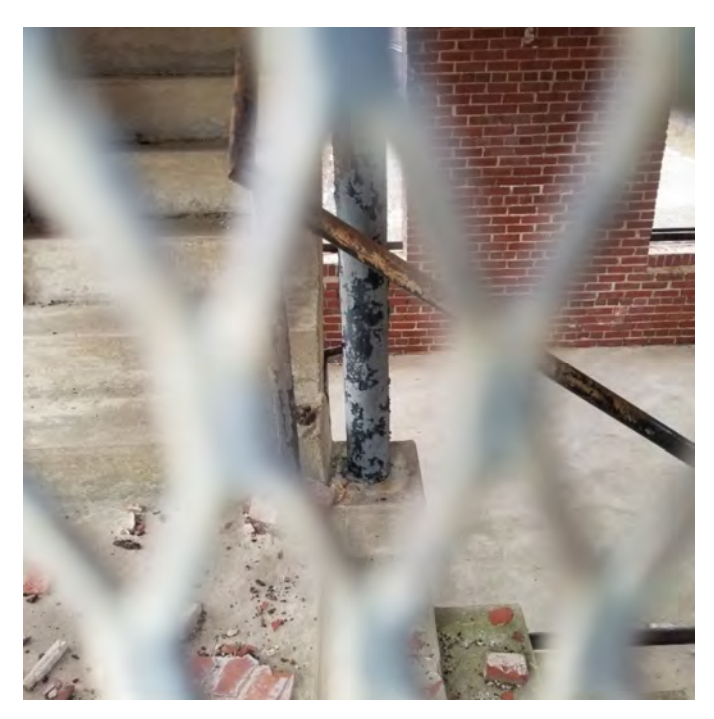
PHOTOGRAPH NO. 23: INTERIOR FIRE POLE