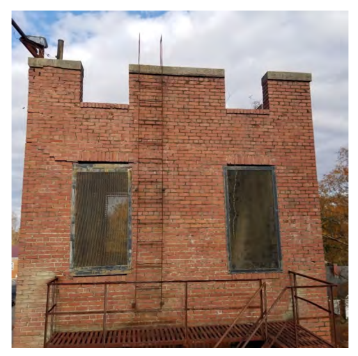
PHOTOGRAPH NO. 4: FRONT VIEW 5<sup>TH</sup> FLOOR