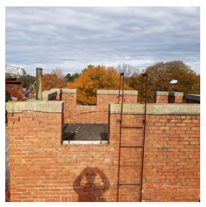
PHOTOGRAPH NO. 20: VIEW OF ROOF