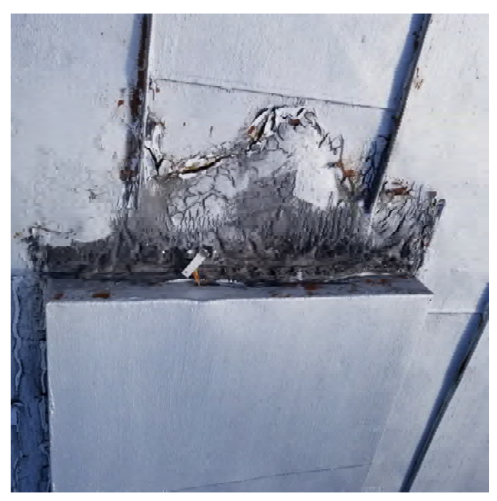
PHOTOGRAPH NO. 30: ROOF FLASHING AT COVERED SKYLIGHT