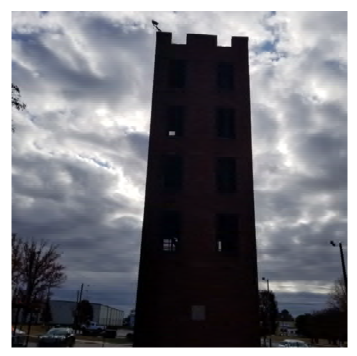
PHOTOGRAPH NO. 2: OVERALL REAR VIEW