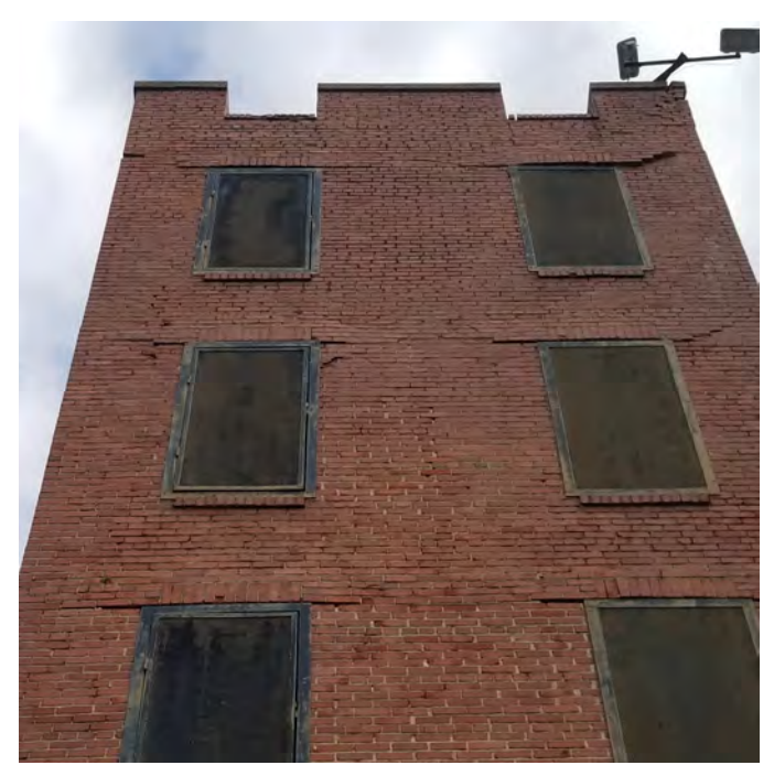
PHOTOGRAPH NO. 9: SIDE VIEW 5<sup>TH &</sup> 4<sup>TH</sup> FLOOR