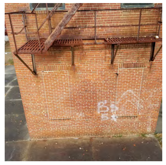
PHOTOGRAPH NO. 8: FRONT VIEW 1ST FLOOR