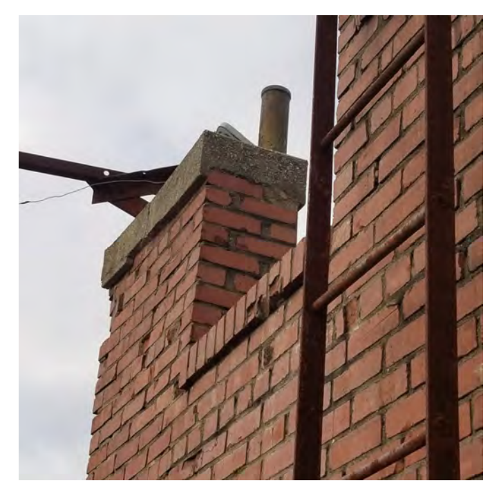
PHOTOGRAPH NO. 18: DAMAGED PARAPET BRICK