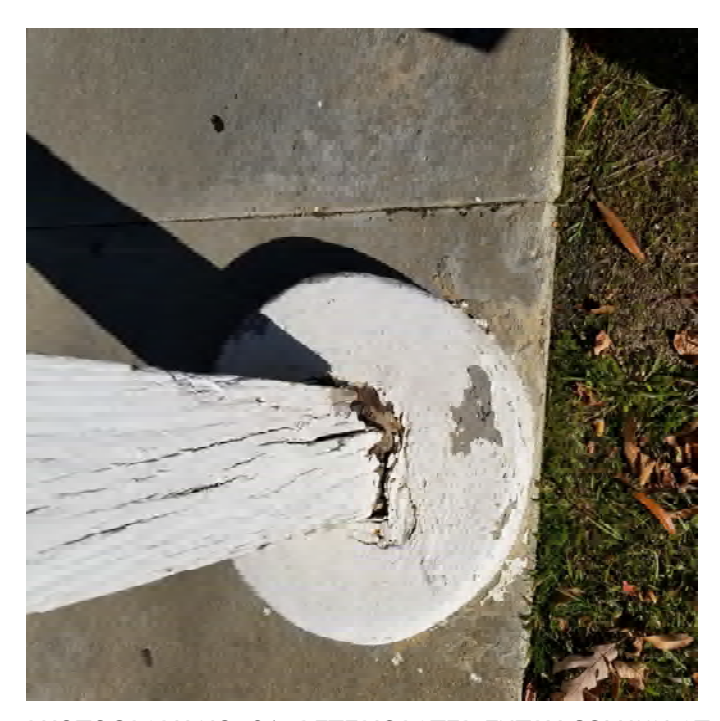
PHOTOGRAPH NO. 36: DETERIORATED ENTRY COLUMN AT BASE