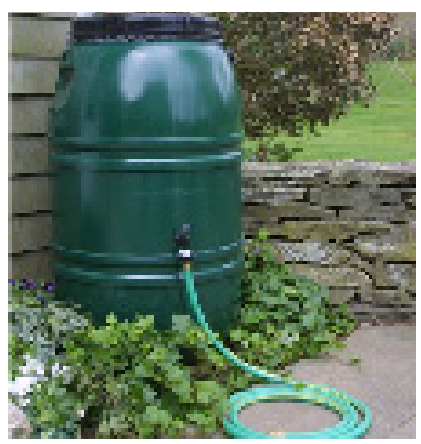
Rain barrels or cisterns can store rain water for irrigation or wash water.