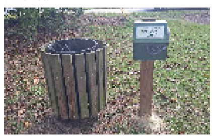
Pet waste stations keep stormwater from being polluted with fecal matter.