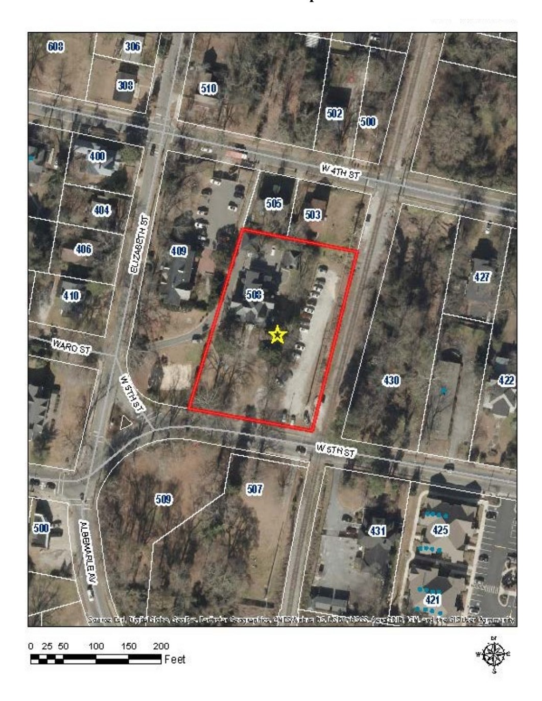
E. B. Ficklen House 508 W. Fifth Street