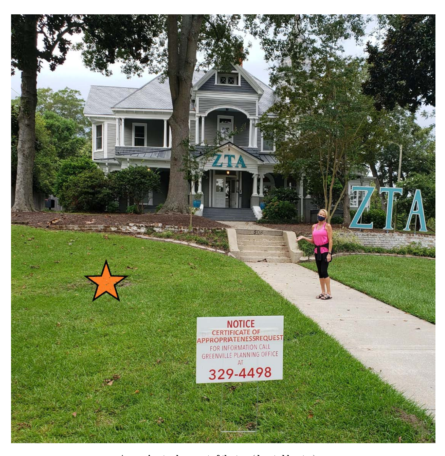
Approximate placement of the tree (denoted by star)

(COA 20-0020: 508 W. Fifth St.) September 22, 2020 HPC Meeting Doc. # 1135238