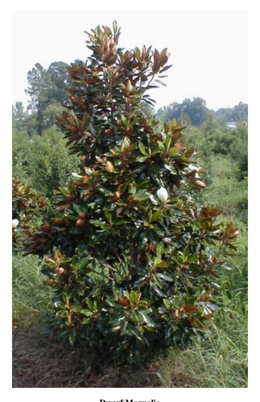
Dwarf Magnolia (Representation of the type of tree to be planted)

(COA 20-0020: 508 W. Fifth St.) September 22, 2020 HPC Meeting Doc. # 1135238