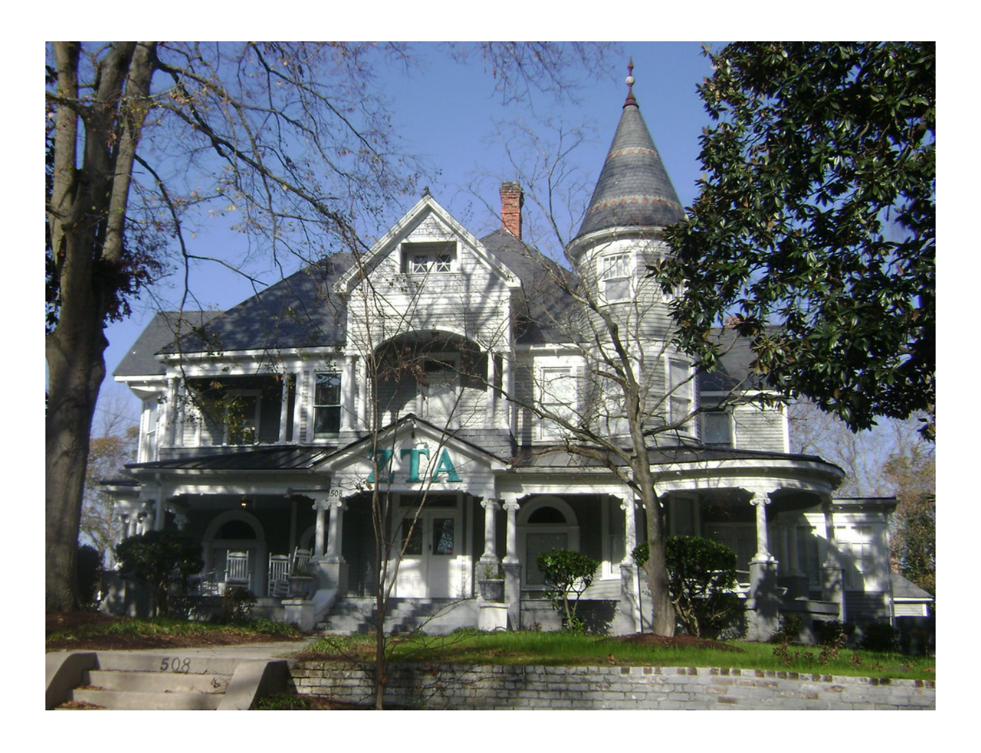
E. B. Ficklen House

comments. Three members of the DRC recommended approval.