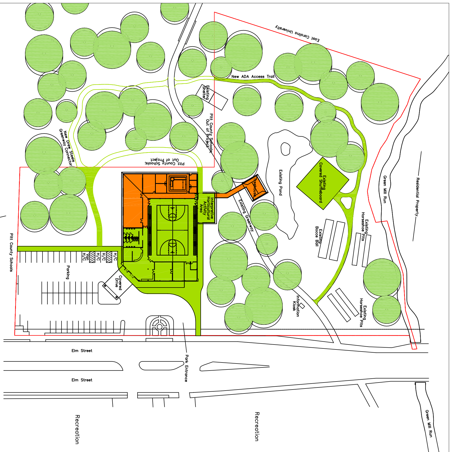
Site Plan; Scale= 1" = 80'-0"

PARTF Site Plan Greenville Recreation & Parks Greenville, N.C. December 21, 2009