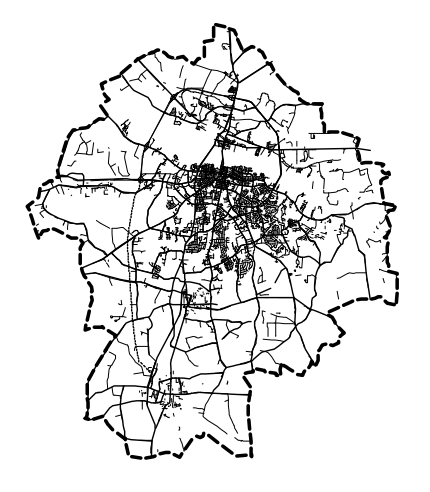
GREENVILLE URBAN AREA METROPOLITAN PLANNING ORGANIZATION