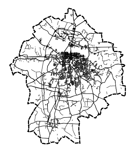
GREENVILLE URBAN AREA METROPOLITAN PLANNING ORGANIZATION