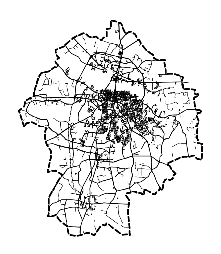
GREENVILLE URBAN AREA METROPOLITAN PLANNING ORGANIZATION