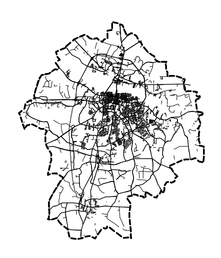
GREENVILLE URBAN AREA METROPOLITAN PLANNING ORGANIZATION