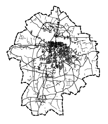
GREENVILLE URBAN AREA METROPOLITAN PLANNING ORGANIZATION