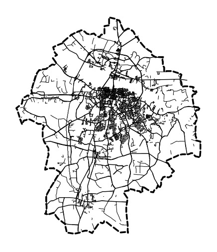
GREENVILLE URBAN AREA METROPOLITAN PLANNING ORGANIZATION