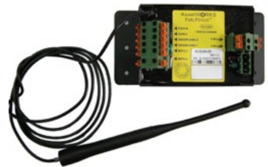
FuelFocus RF Vehicle ID Box, Antenna Cable and Antenna Mast