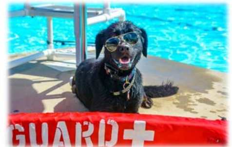
Doggie Pool Party