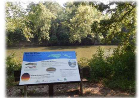
Interpretive signage at River Park North