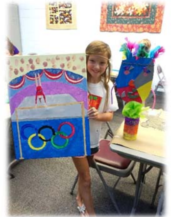
Famous Artist Camp