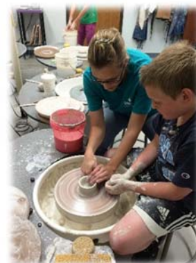
Young Potter's Wheel Class