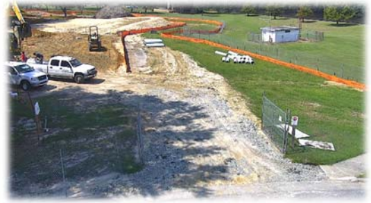
Playground at Town Common