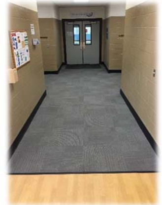
New carpet at GAFC