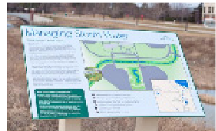
Informational boards serve to educate the public.