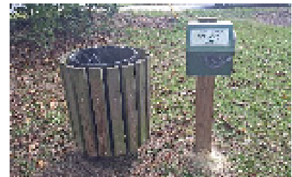
Pet waste stations keep stormwater from being polluted with fecal matter.