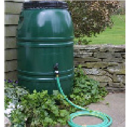
Rain barrels or cisterns can store rain water for irrigation or wash water.