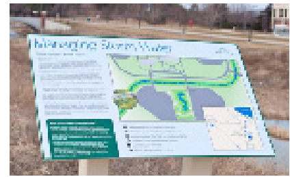
Informational boards serve to educate the public.