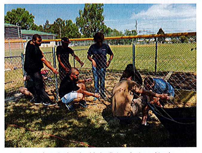
A group from the Leadership Institute volunteered to place a Community Garden at South Greenville Recreation Center.

ECBL plays baseball with ECU's baseball team at Clark-LeClair Stadium.