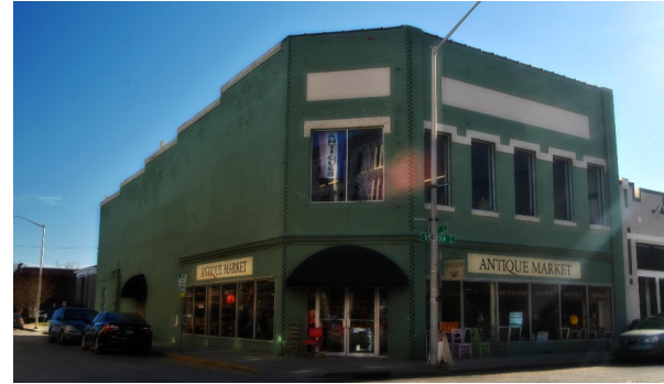
December Dickinson Avenue Antique Market