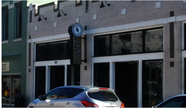
October Dickinson Avenue Public House