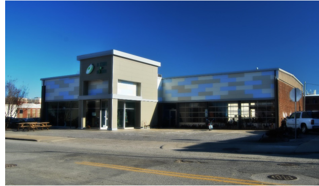
February Go Science Center