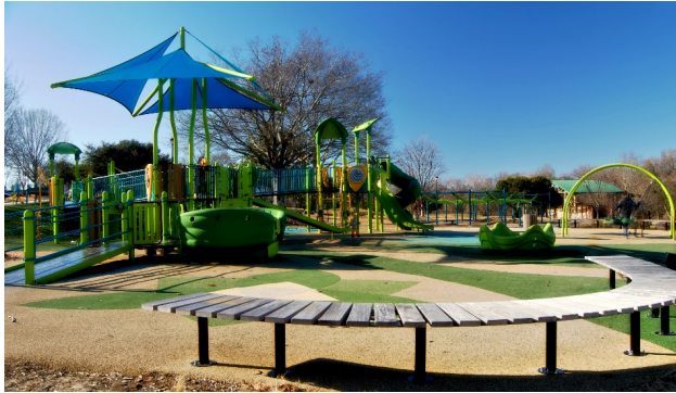
February Town Common Inclusive Playground