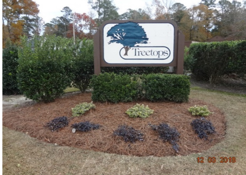
Treetops Home Owners Association