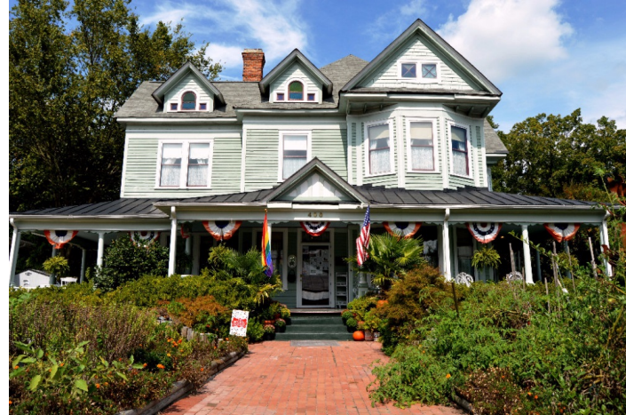
The Music House