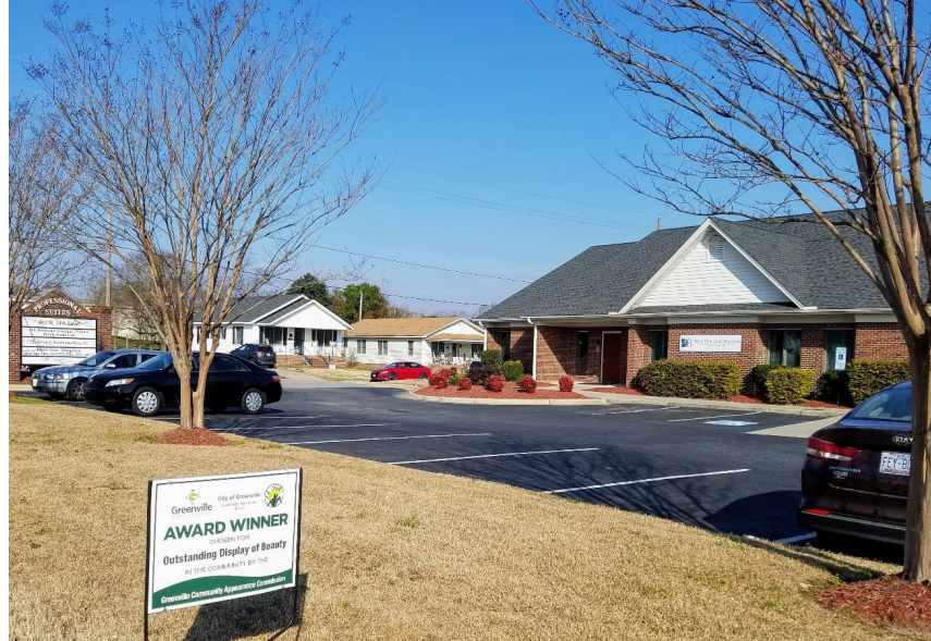
Brown Law Firm