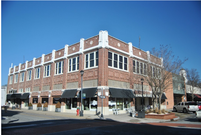
Coastal Fog Market