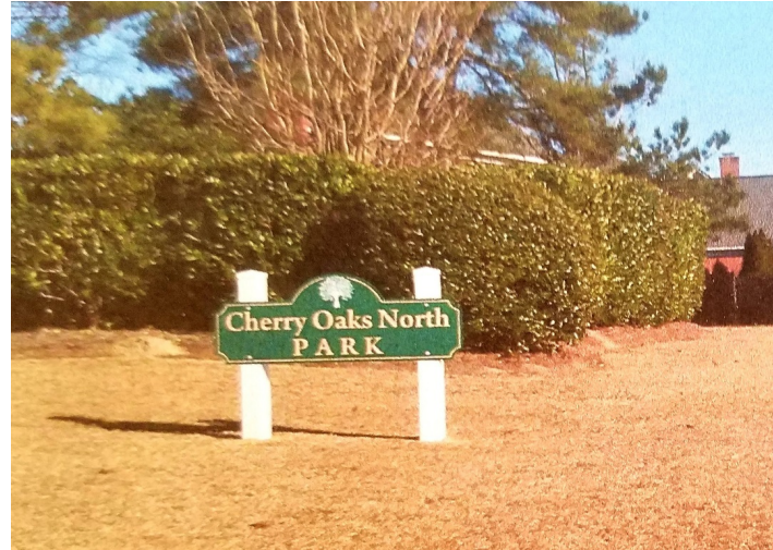
Cherry Oaks North