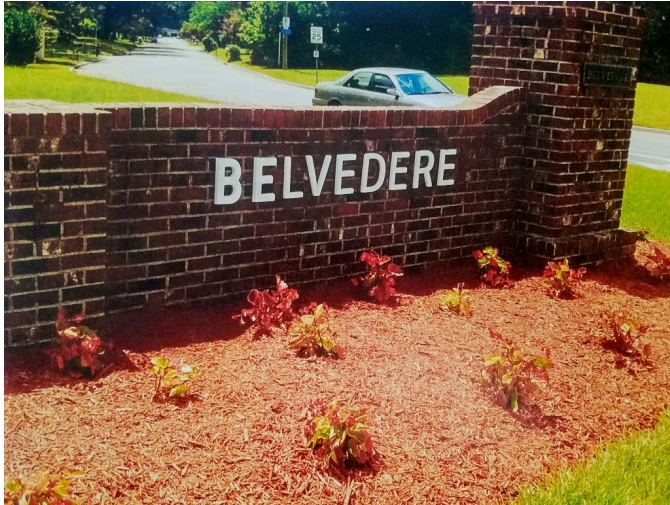
Carolina East Neighborhood Association