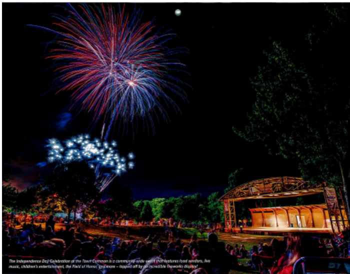
The Independence Day Celebration at the Town Common is a community-wide event that features food vendors, live music, children's entertainment, and fireworks and more – topped off by an incredible fireworks display.