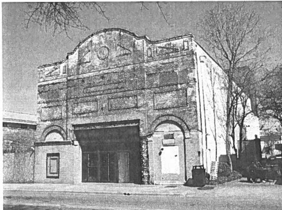
White's Theater, façade view