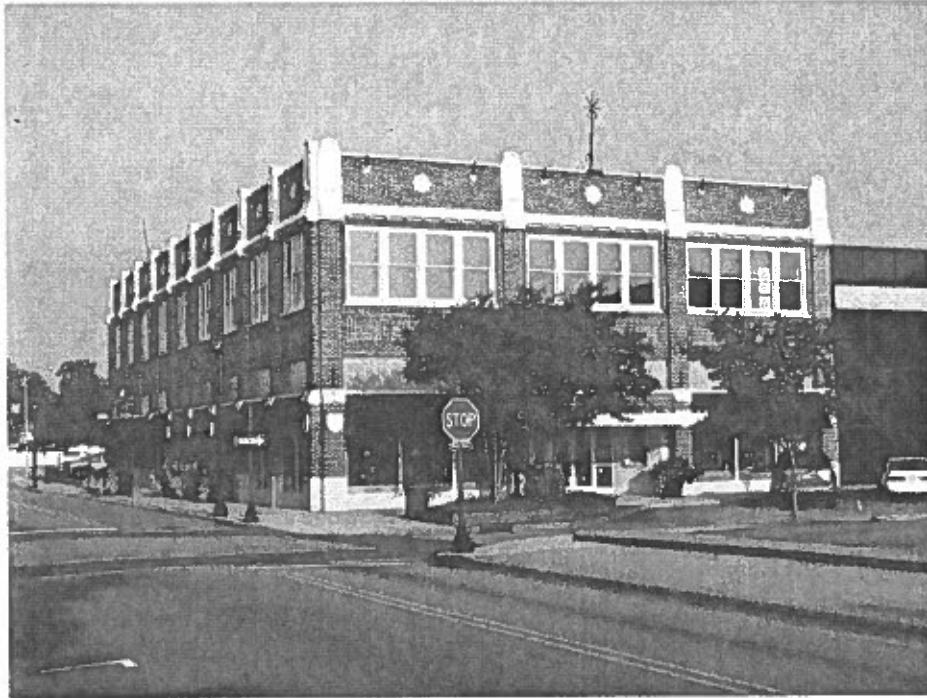
Blount-Harvey Department Store, façade view

Photographs by Druscilla York, September 2008 and March 2009