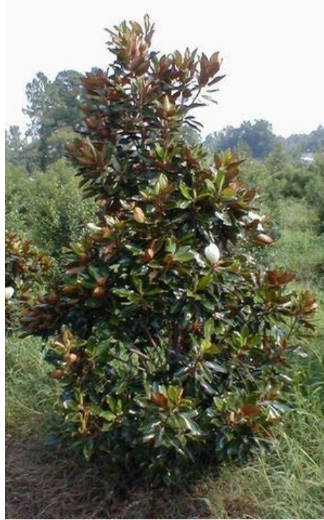
Dwarf Magnolia (example)