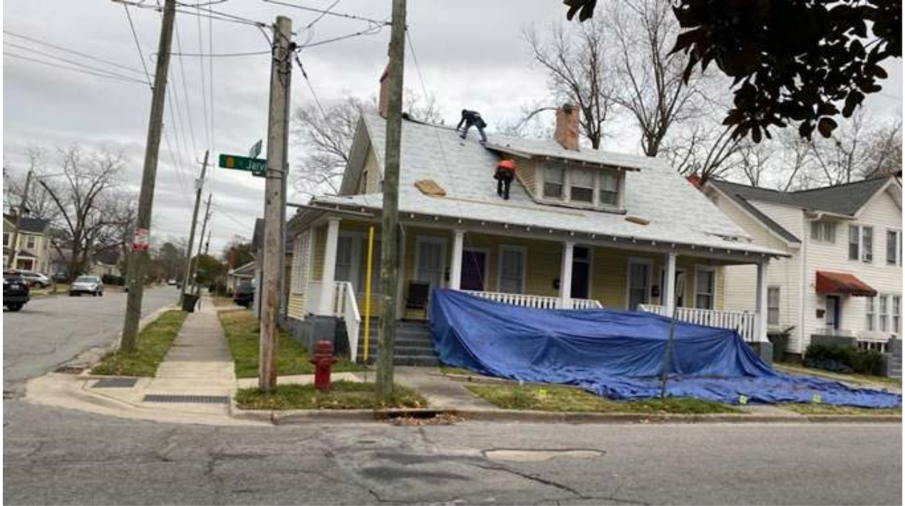
2022-0006 - 401 S. Jarvis Street Replace roof with like color and shingles