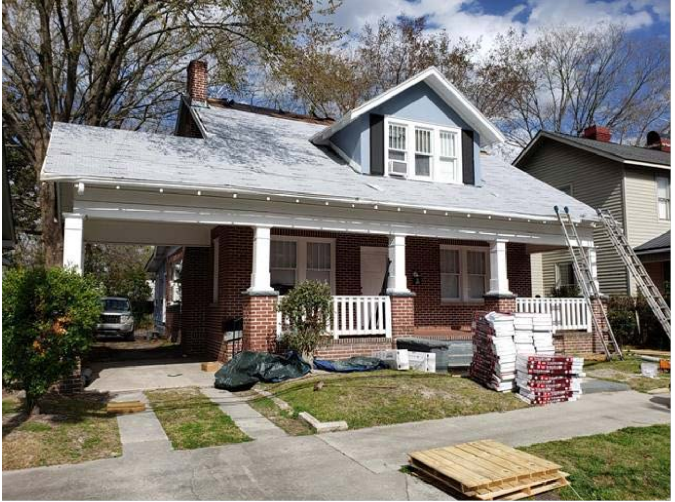
2022-0008 - 705 E. Fourth Street Replace roof with like color and shingles