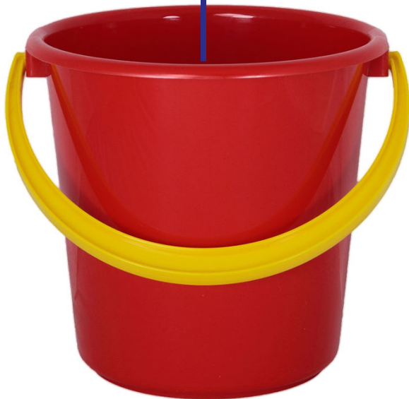
Revenue Replacement - Unrestricted