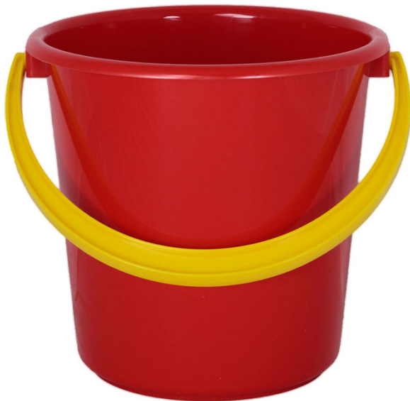
Revenue Replacement - Unrestricted