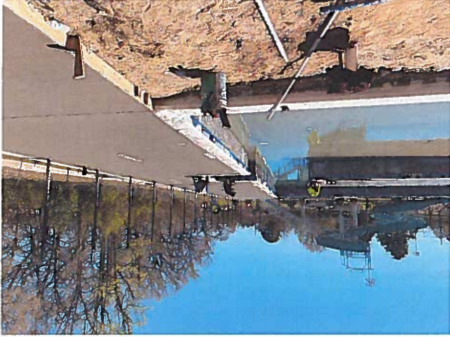
Outdoor Pool Construction