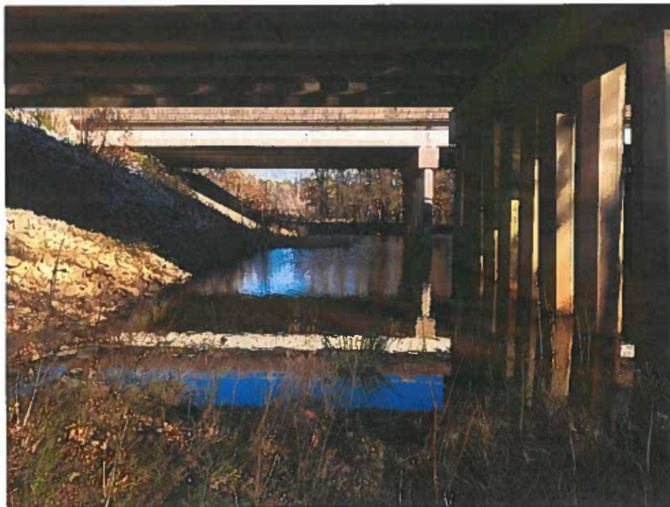
Picture is taken from the west parcel of Wildwood Park looking east.

(A raised sidewalk will be constructed under these bridges to link Wildwood Park East to Wildwood Park West)