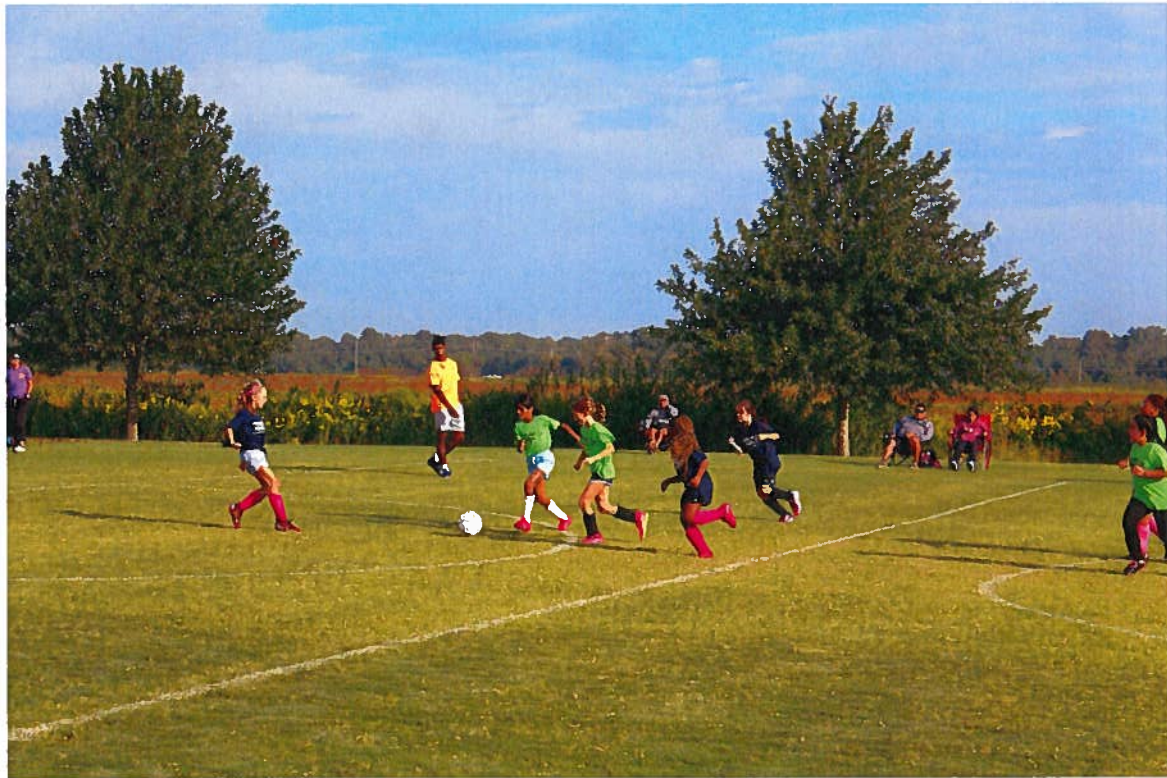
Fall Future Stars