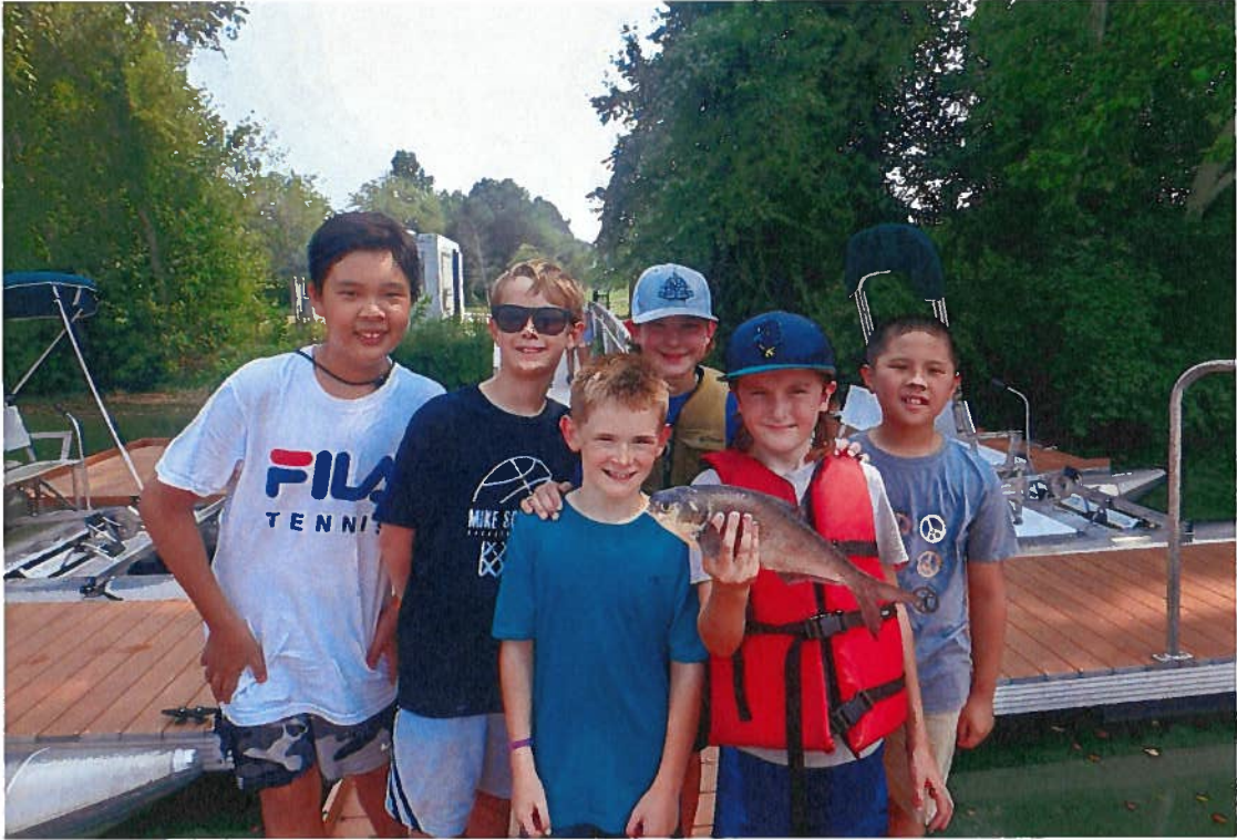
Fishing at River Park North