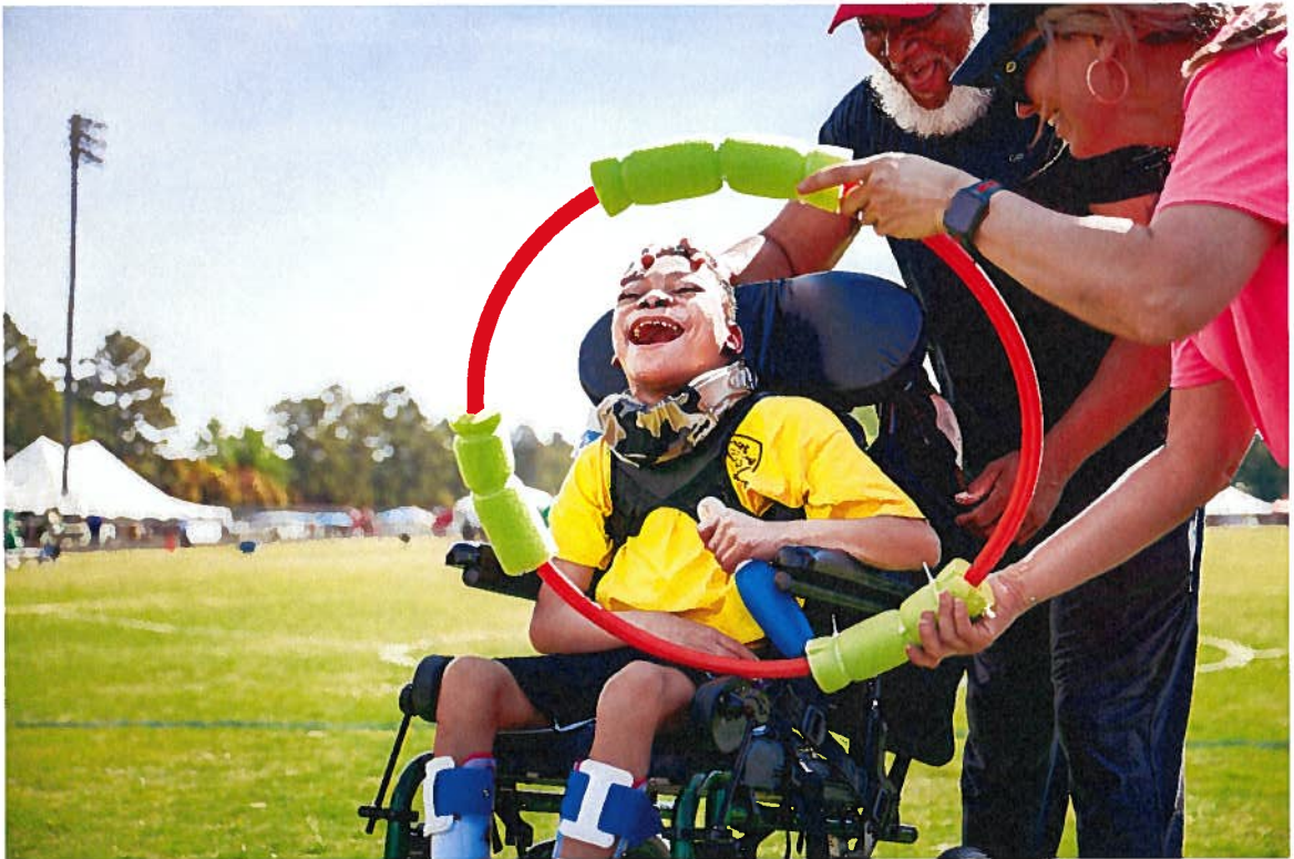
Special Olympics Spring Games