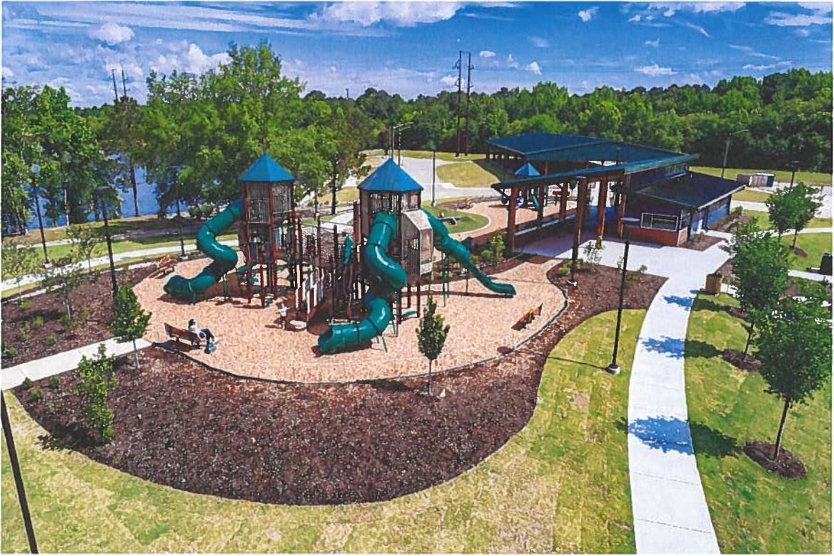
Wildwood Park Playground