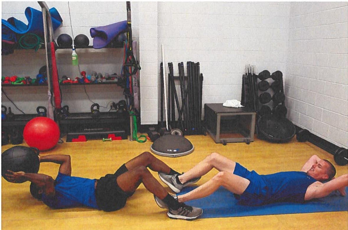
HIIT Class at the Greenville Aquatics & Fitness Center