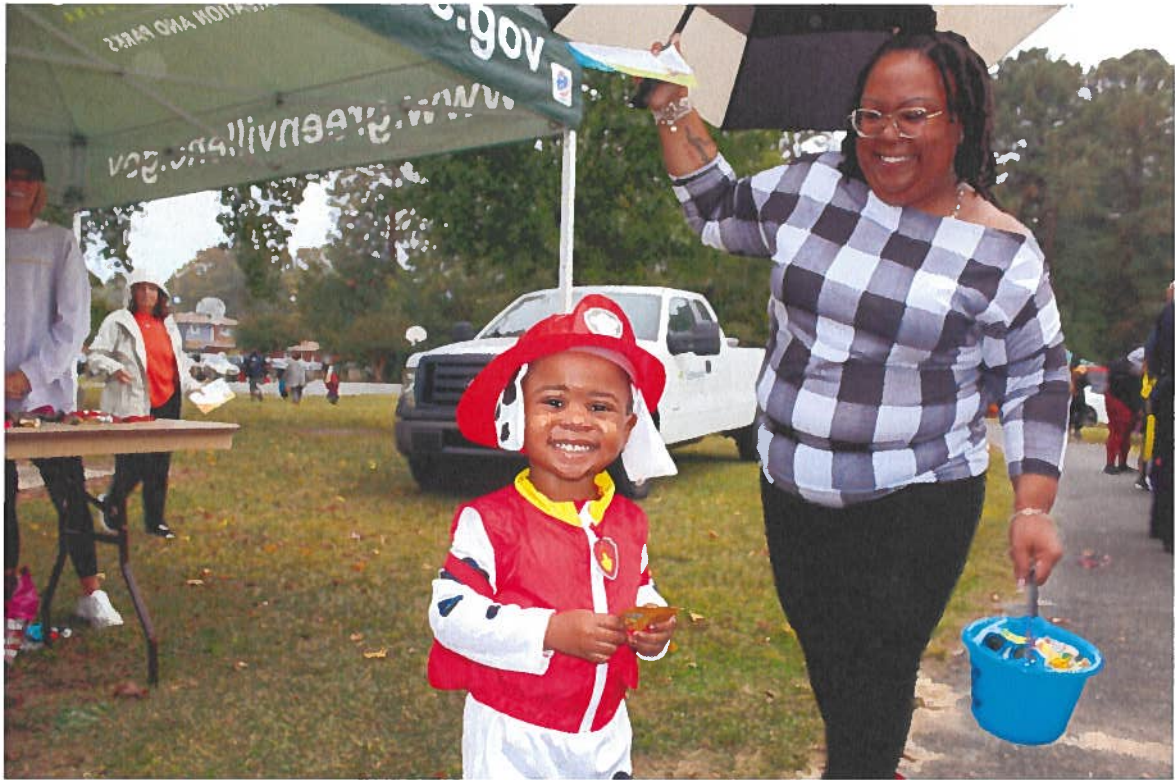
Trunk or Treat at Greenfield Terrace Park