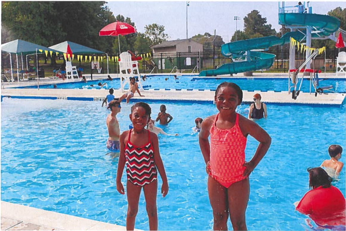
Summer Camp Participants using the Outdoor Aquatic Center