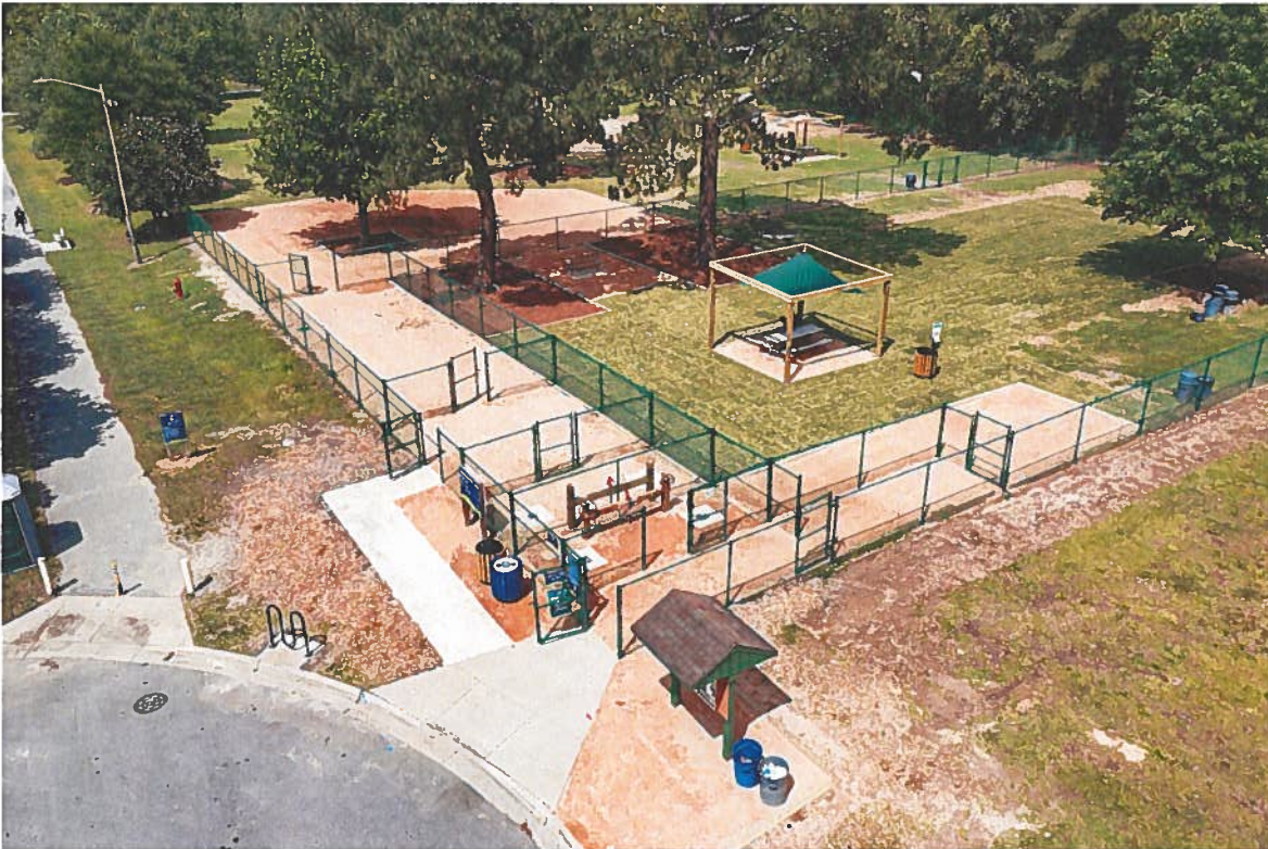
Off-Leash Dog Area after Upgrades