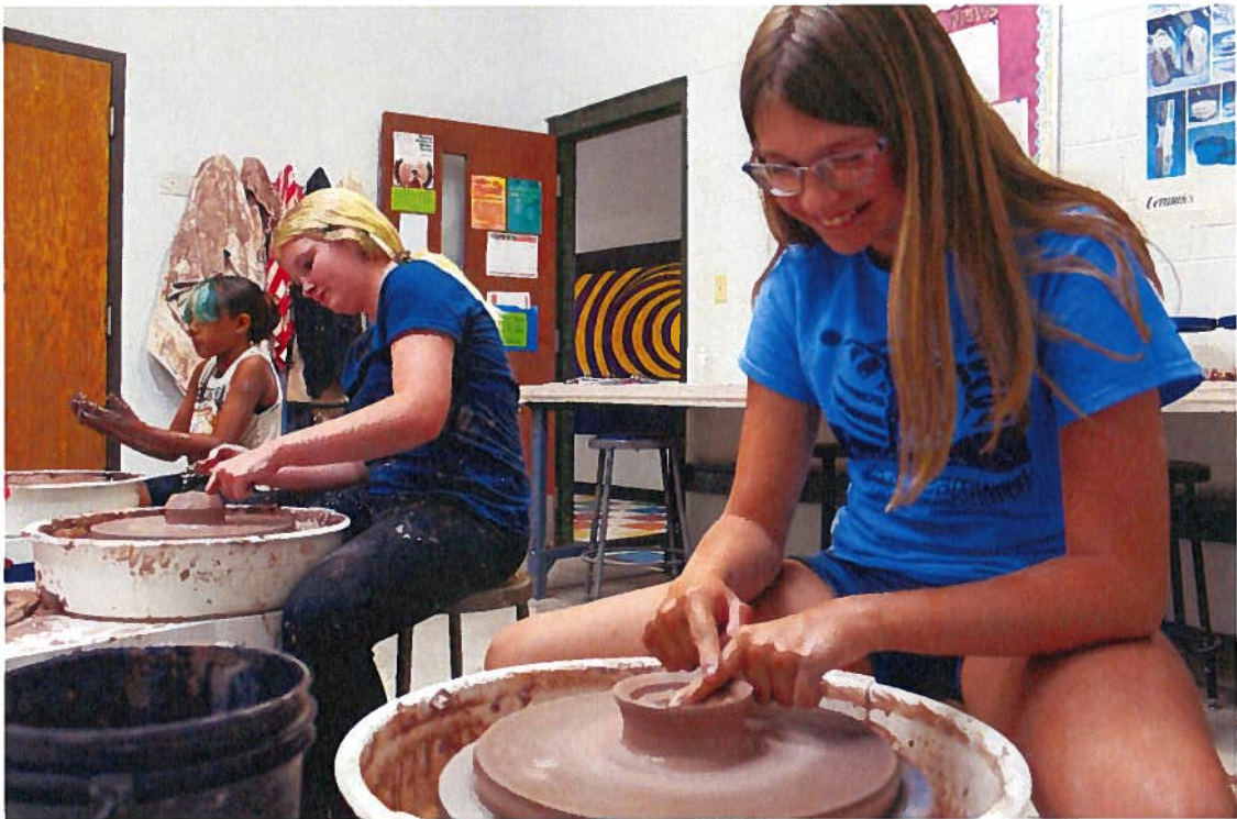
Young Potters Wheel