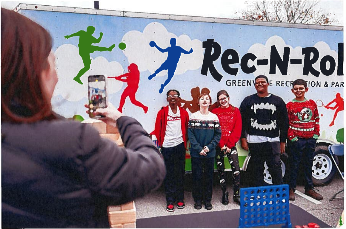
Rec-N-Roll Mobile Recreation Unit