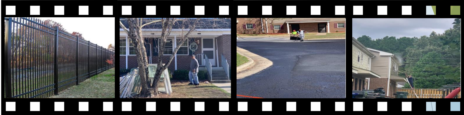
Hopkins Ornamental Fence Project