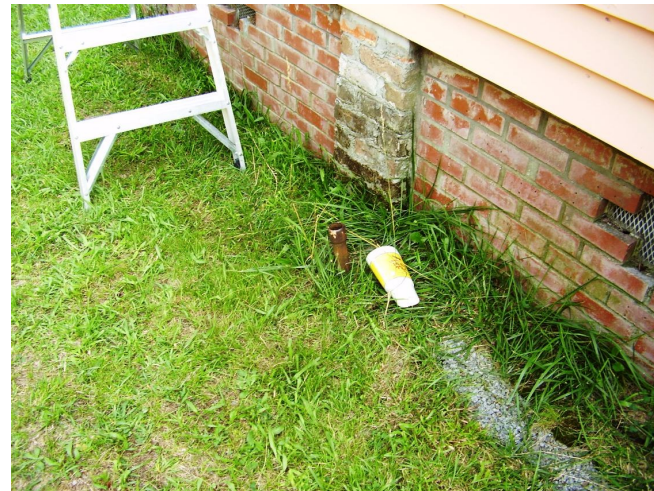
UST pipe at 823 Evans St.