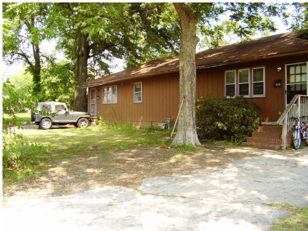
201 9 th St. front with gas connection