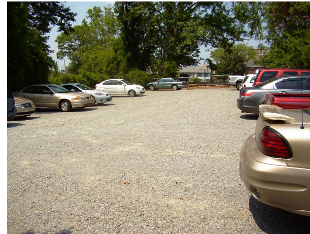
Parking on 9 th St. parcel behind 810 Cotanche St.