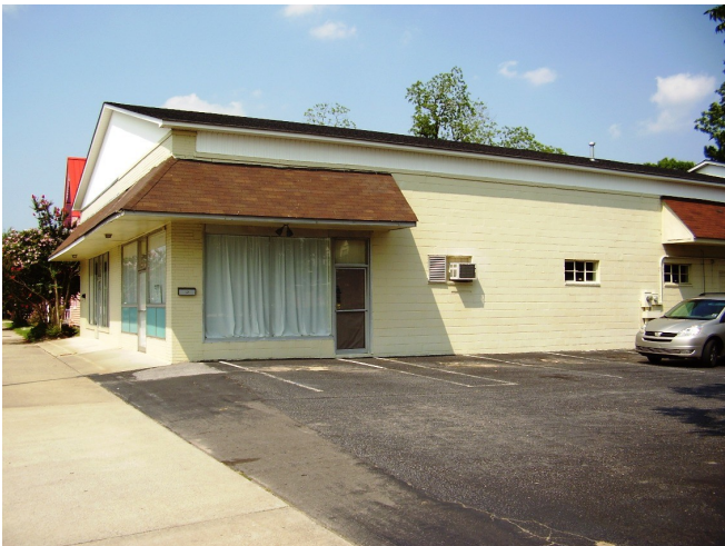
813 Evans St. with 811 Evans St. addition.