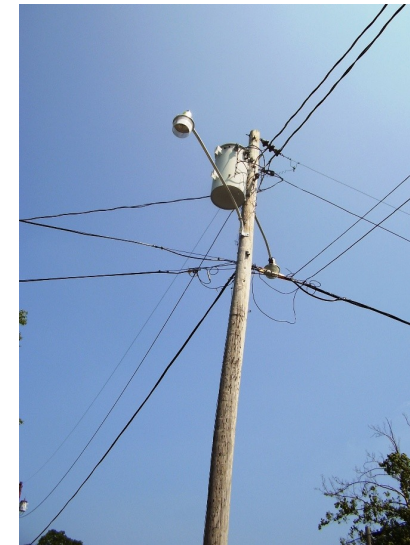
Large pole-mounted transformer on 9 th St.