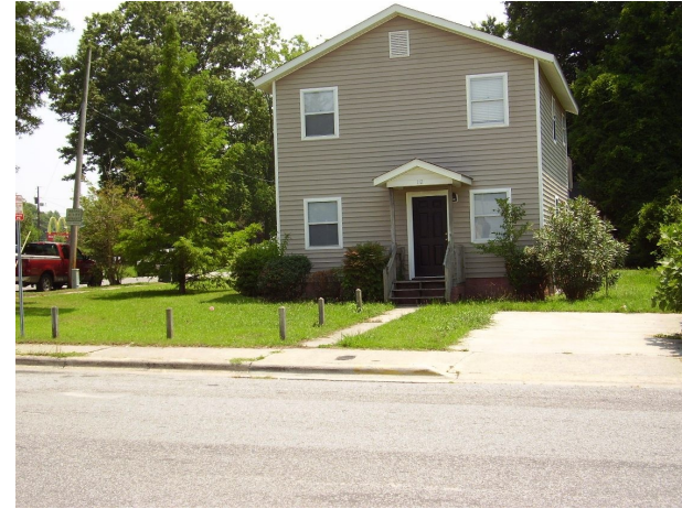
112 8 th St.