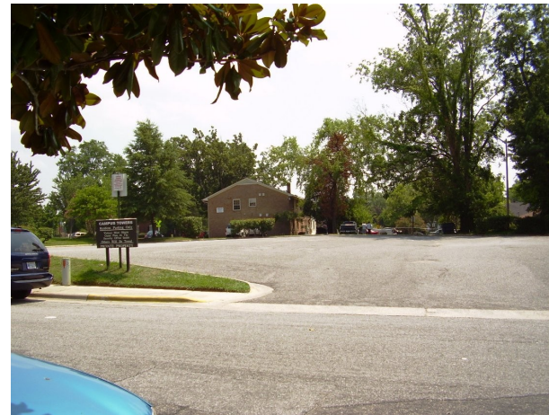
Corner of 8 th St. and Cotanche St