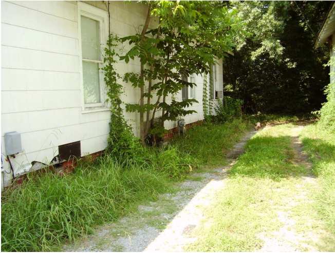
Gas connection & asbestos siding at 111 9 th St.