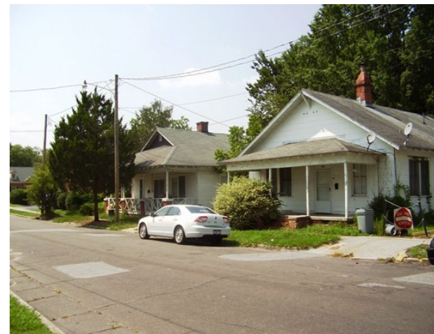
111 and 113 9 th St.