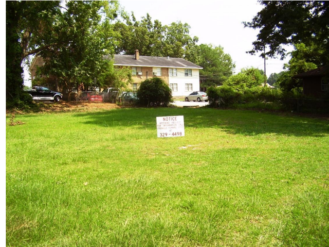
Vacant lot at 809 Forbes St.