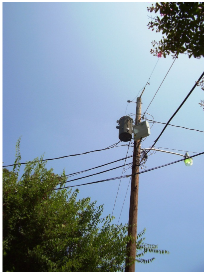
Small pole-mounted transformer on 9 th St.