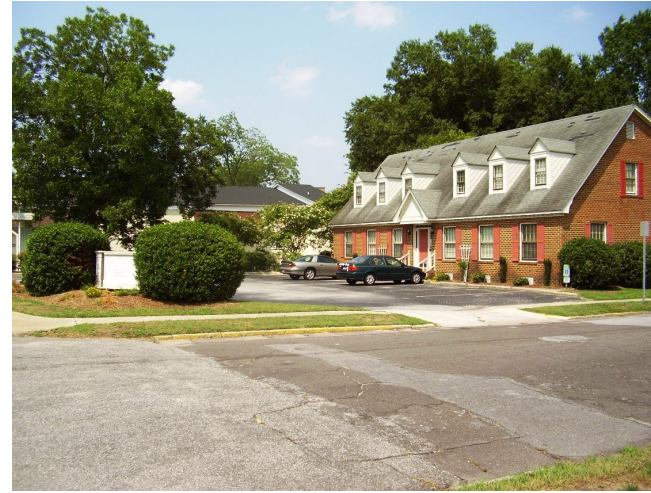
823 Evans St.