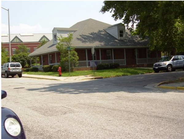
200 8 th St.