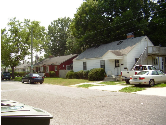
802 Forbes St. with asbestos siding & 804 Forbes St.