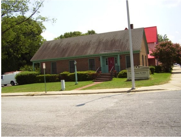
801 Evans St.